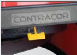
Handle for easy transportation